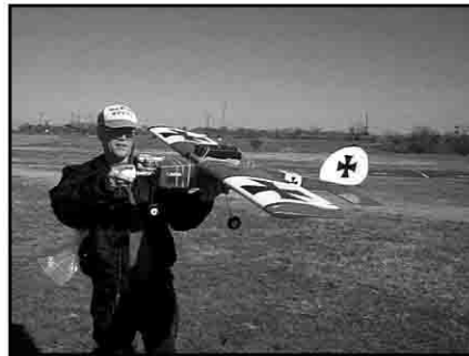
Figure 1—The author with an ATV-equipped Ugly Stick .