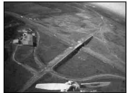
An ATV frame capture from the Butterfly .

on a demonstration/volunteer basis in much the same way hams provide the National Weather Service with rainfall data. Using the camera-equipped planes we were able to fly over and videotape otherwise inaccessible creeks and riverbeds. The USGS used this data to assess water flow resistance and flood potential in times of high rain. The radio-controlled "camera planes" offered a low-cost and low-risk alternative to manned flight. The experiment turned out to be a highly successful and satisfying adventure.