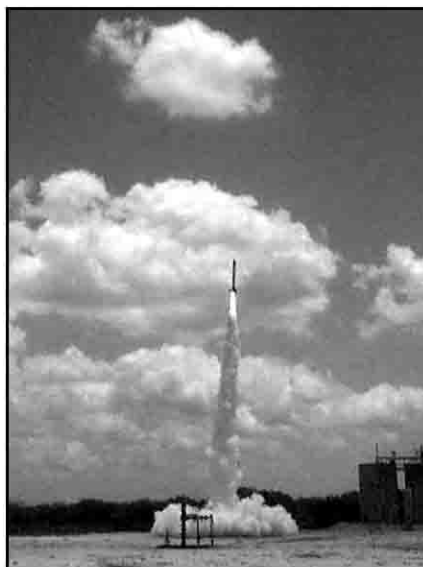
Figure 2— Big Yeller takes to the skies with GPS and ATV payloads.

While the students at K-SAT build their three-foot-tall rockets, the adult kids build theirs. The big kids' "heavy lifters" stand 11 feet tall and carry an ATV transmitter with video overlays that display GPS position, speed, heading and altitude. Constructed under the expert guidance of Bill Wagner, these rockets require FAA coordination and need lots of empty land around them to fly. After months of rain delays, we finally got a chance to fly one of the big rockets in May 1999 at a 22,000-acre cattle ranch in southern Texas belonging to Rik Hoffman, K5SBU. The rocket carried a side-looking color camera