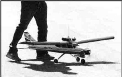
The ATV-equipped Tower TH60 ready for takeoff.