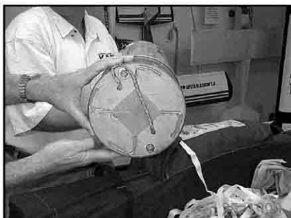
Figure 4—The circularly-polarized ATV antenna on the rocket payload bulkhead.

The best airplane ATV antennas have been simple vertical ground-planes or vertical dipoles. For short-range flights the receive antenna was a simple quarter-wavelength vertical mounted on my car with a mag-mount. For longer-range airplane flights and for rocket flights, a 10-element beam (a KLM 440-10x) was connected to the receiver. The airplane's flight pack receiver uses a standard trailing-wire antenna supplied by the manufacturer. The control receiver and antenna are configured for horizontal polarization and are mounted as far away from the ATV antenna as possible.