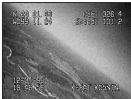
The view from the K-SAT rocket at 7000 feet.

Our antennas are designed to maximize range and minimize interference between co-located functions. In the airplanes, this is the ATV transmitter and the flight pack receiver. In the rocket, it is the ATV transmitter and the GPS receiver. An additional goal is to provide uniform coverage with minimal dropouts in the coverage pattern.