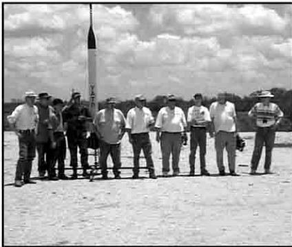
The KSAT rocket and launch team.

These steps were sufficient to guarantee no loss in control range for my RC aircraft. More stubborn cases may require shielding the receiver, decoupling each servo lead with feed-through capacitors or chokes where the lead enters the shielded receiver compartment and inserting a low-pass filter in series with the antenna lead. Before flying with ATV gear, carefully "range test" the system on the ground with the engine turned off. A typical test involves removing or collapsing the transmit antenna and backing away from the aircraft while observing the control surfaces. Tests should be performed with the ATV transmitter on and off to make sure that the maximum control range has not been compromised.