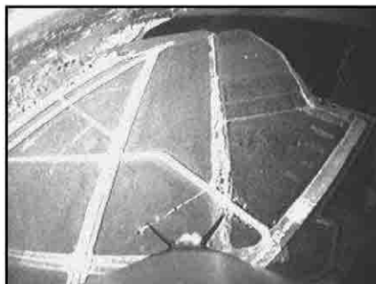
Figure 3—Looking down the rocket fuselage at Hondo airport.

and a 1.5-W ATV transmitter. After the pre-filed clearance was obtained from Houston center via cell phone, we started a quick countdown and hit the switch. The rocket leaped into the air atop a mountain of fire and roared away with Doppler-shifted thunder, ever decreasing in pitch as the rocket accelerated to 401 MPH. During its seven-second burn, the rocket consumed $360 of solid fuel at a rate of slightly more