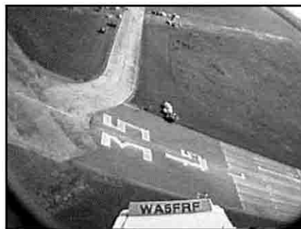
The Hondo airport as seen from the TH-60.