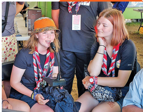
The neckerchief is the universal uniform wear for Scouts throughout the world.

Antennas, provided by JK Antennas, included a rotatable 40-meter dipole, C3S triband Yagi, and a special 20/17-meter dual-band Yagi. In addition, we used dipoles for 30 and 80 meters as well as a 6-meter Yagi.