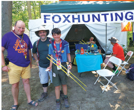
Amateur Radio direction finding (also known as “foxhunting”) generated a great deal of interest among the Scouts.